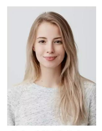
Bitte Ihr persöhnliches Bild einfügen! Please insert your personal image! ¡Por favor, inserte su foto personal!